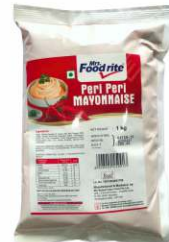
Peri Peri Mayonnaise