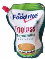
Premium Eggless 100g