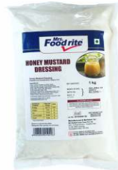
Honey Mustard Dressing