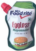
Premium Eggless 875g