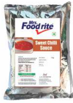
Sweet Chilli Sauce