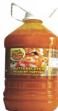
Butterscotch Dessert Topping