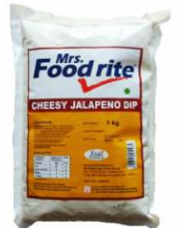
Cheesy Jalapeno Dip