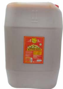
Red Chilli Sauce