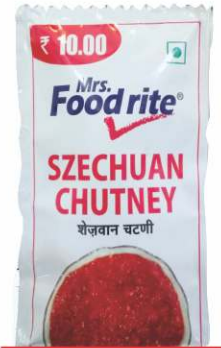
Szechuan Chutney 40 g