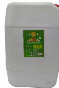
Green Chilli Sauce