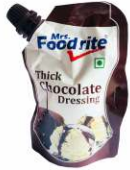
Thick Chocolate Dressing