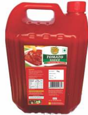
Tomato Sauce No Onion No Garlic