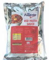
Red Pasta Sauce