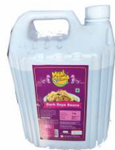
Dark Soya Sauce