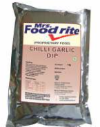
Chilli Garlic Dip