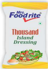
Thousand Island Dressing