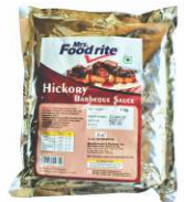
Hickory Barbeque Sauce