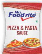
Pizza & Pasta Sauce