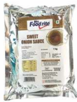
Sweet Onion Sauce