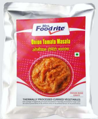
Onion Tomato Masala