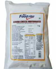
Gouda Cheese Mayonnaise