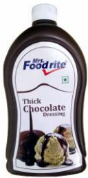
Thick Chocolate Dressing