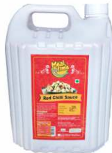
Red Chilli Sauce