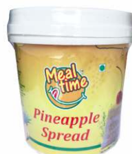
Pineapple Spread 1kg