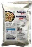
White Pasta Sauce