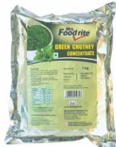
Green Chutney Concentrate