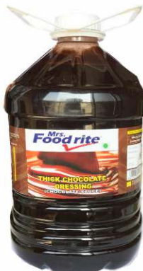
Thick Chocolate Dressing