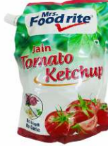
Jain Tomato Ketchup