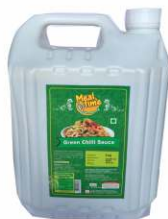
Green Chilli Sauce