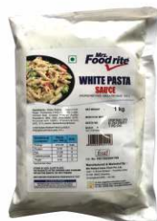
White Pasta Sauce