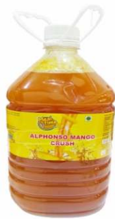
Alphonso Mango Crush