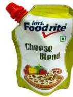
Cheese Blend 80 g