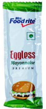
Eggless Premium Sachet 12 g