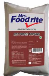
Hot Fudge Topping