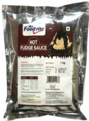
Hot Fudge Sauce