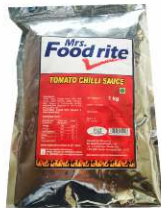
Tomato Chilli Sauce