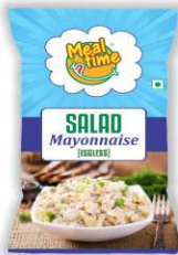
Salad Mayonnaise (Eggless)