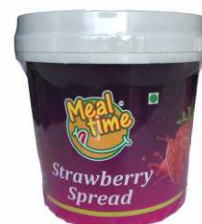
Strawberry Spread 1kg