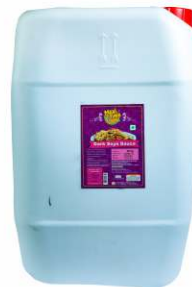
Dark Soya Sauce