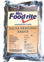
Salsa Mexicana Sauce