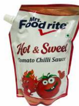
H & S Tomato Chilli Sauce