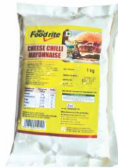
Cheese Chilli Mayonnaise