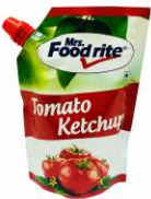
Tomato Ketchup 425 g